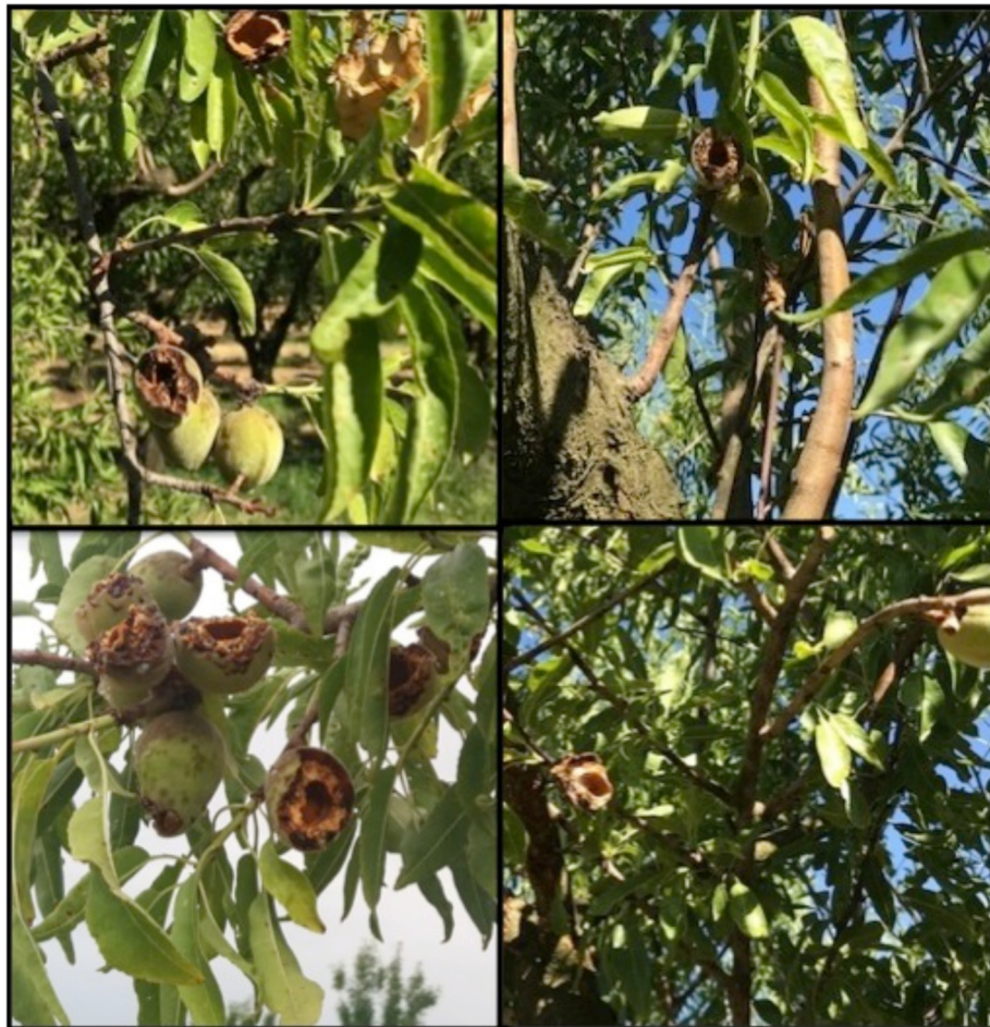
Fig. 1 – Fruit damage caused by ring-necked parakeet, Psittacula krameri , on almonds (Rome, central Italy; for quantitative data, see results).

The study was carried out in September 2017 when the almond fruits are ripe, and furthermore it is the end of the breeding period of ring-necked parakeets so that juveniles may also forage on fruits [23]. A previous census using point count method (n = 120; sessions with fixed time: 5 min.) in all experimental orchards estimated a number ranging between 0-3 ind./session (G. Assogna, unpublished data). To obtain data on the impact of parakeets on almond fruits, first we randomly selected a set of trees (n = 48) inside the almond orchard sample, using a random number generator. Then, we counted the number of total available almond fruits occurring on each tree, checking for the almond fruits with evident damage caused by ring-necked parakeet (about four hours in the sampling effort in a single sampling day). All the fruits that showed evident damage from scarification and rupture (as shown in Fig. 1) were counted. We assigned the damage on almonds to the specific action of parakeets, considering