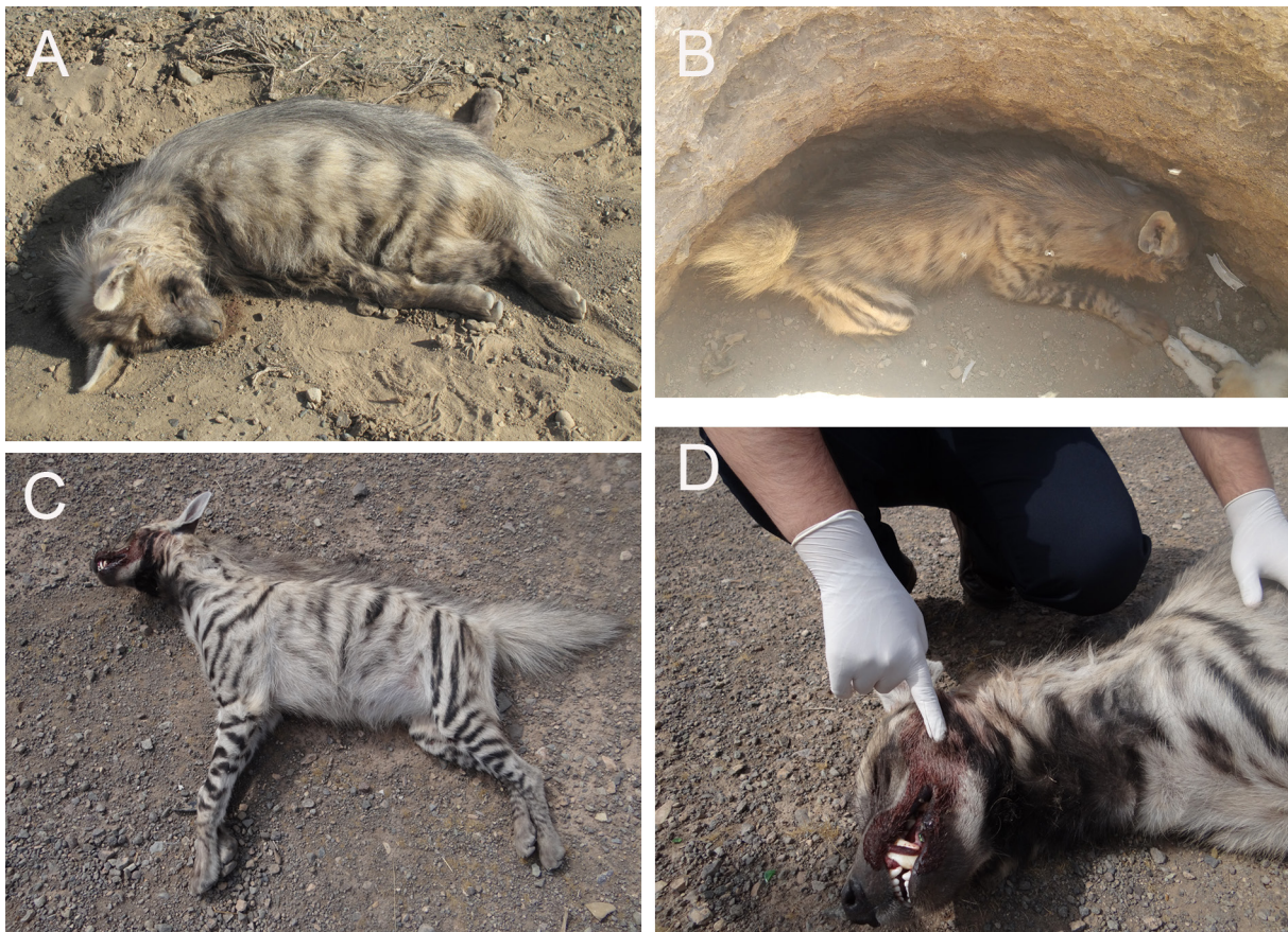
Fig. 2– Images of Hyaena hyaena . A. Killing by farmers. B. Killing for using the genital female system. C–D. Road kill.

We used the maximum entropy (MaxEnt) modeling approach which is based on species presence data and environmental factors to predict potential distribution patterns. It is considered one of the most efficient techniques for predicting species distribution models based on presence only data (ELITH et al. 2006; PHILLIPS et al. 2006; ELITH et al. 2011). The aim of this study was to provide a comprehensive distribution map for striped hyena to recognize the environmental variables associated with the predicted distribution of this species using the MaxEnt distribution modeling approach.