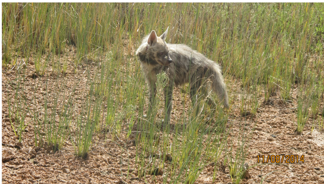
Fig. 1 – Images of Hyaena hyaena in natural habitat.

ZIAIE (2008) believed that the Iranian population of hyenas has severely declined. They live in steppes, semi-deserts, rocky fields and valleys with sparse trees (MILLS & HOFFER 1998; Fig. 1); they avoid deserts, high altitude areas, dense bushes and forests. Striped hyenas prefer living inside caves (MILLS & HOFER 1998; YILDIRIM 2010). These animals participate in the ecosystem by eating dead and decaying animal carcasses (MILLS & HOFER 1998; BUNAIAAN et al. 2001; SINGH 2008; STEIN et al. 2013). The dietary preferences of this species include vertebrate (BON et al. 2012) and invertebrate animals, various fruits, vegetables and human-sourced organic wastes (WAGNER 2006). Being a dietary opportunist, hyenas are omnivorous carcass eaters. When starved, they can feed on melons, watermelons, grapes and some other vegetables (MILLS & HOFFER 1998; YILDIRIM 2010). Recently, factors have generally led to major habitat loss (Fig. 2). Therefore, it is very important to protect the hyenas’ habitats. As such, habitat management based on evaluation is strongly recommended as a practical solution.