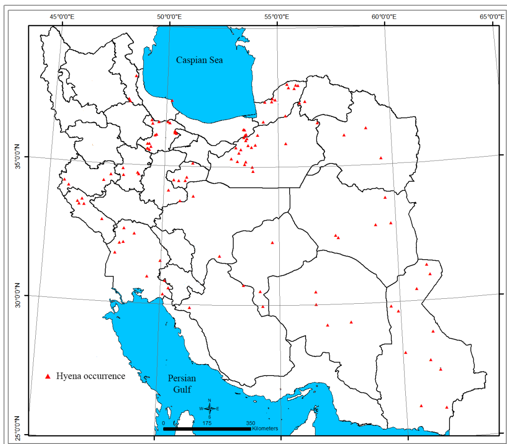
Fig. 3 – Distribution of hyena occurrence points applied in habitat suitability modelling.

The most common approach for testing the predictive performance is to divide data into 'training' and 'test' datasets. This approach creates relatively independent data for model testing (FIELDING & BELL 1997; GUISAN et al. 2006). Then, MaxEnt was carried out with default settings when separating records into training and test samples (75 and 25%, respectively) (PHILLIPS & DUDIK 2008). Convergence threshold and maximum number of iterations were remained as default (0.00001 and 500, respectively) and auto feature. The cross-validation has been used to evaluate the predictive performance of the model. In addition, Jackknife testing was produced to estimate the average contribution and response of each variable to the model.