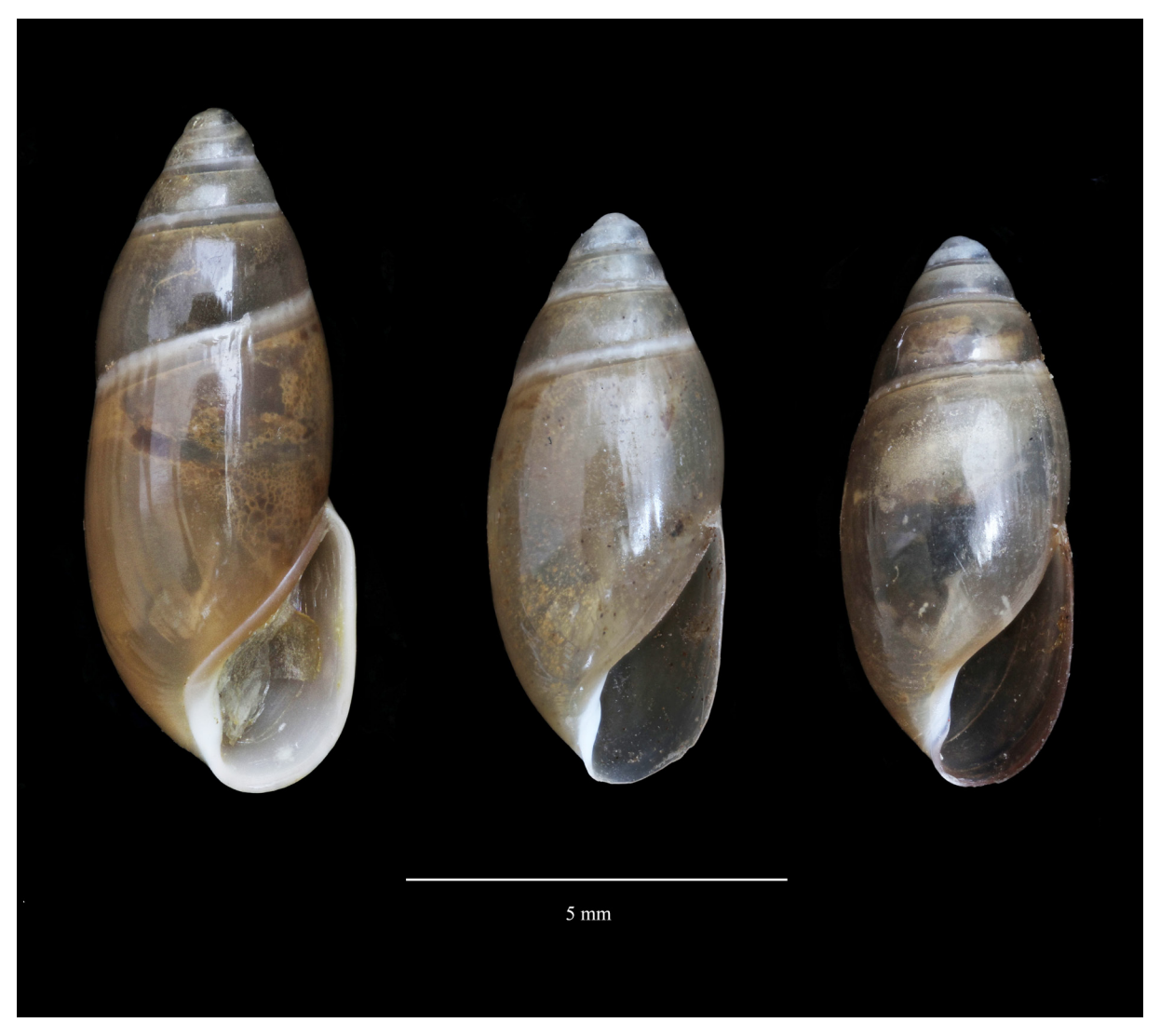
Figure 2 – Ferussacia folliculum. Left and middle: adult and subadult specimens from Malta, Malta, Hal-Ferh, Ghajn Tuffieha (1983), coll. RBINS/Subcoll. Poppe, IG.28671, Nr. 177. Right: subadult specimen from Belgium, Niel, 2015, coll. RBINS (Project SPEEDY), IG.32643.

In continental Europe, a single historical (1879) sample has been reported from Parco Ciano, Lugano (Switzerland, Prealpine zone), which was attributed to an occasional introduction via imported Mediterranean plants (17). Yet, more recently, in 2014, the species was found in the 'Jardin botanique alpin du Lauterat' (département Les Hautes-Alpes, France), at an altitude of 2100 m, so far the northernmost and highest-altitude recent record in Europe (9). During a new visit to this locality in summer 2016,