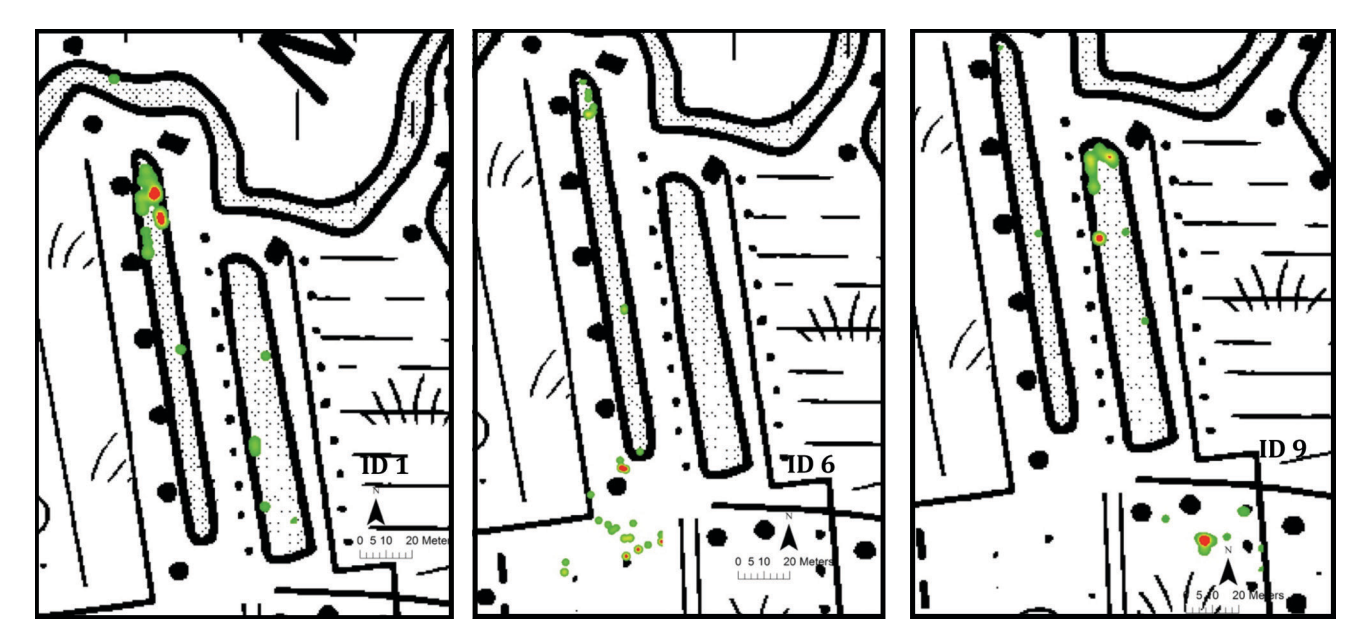
Fig. 2. – KDE50 and KDE95 locations (red and green, respectively) for the individual nr.1, 6 and 9 [see the online version for the colour figure].

As for hibernation, a study in Summit County USA showed that the bullfrogs favour relatively shallow (<1m) sites with algae and cattails, fed by small streams (STINNER et al., 1994). A habitat model made for the American bullfrog showed that the suitability of a wetland as winter cover can be expressed as a combination of the winter water depth and the relative amount of silt in the bottom substrates (GRAVES & ANDERSON, 1987). Another telemetric study in France revealed that 80% of the individuals of the American bullfrog hibernated under mulch in wooded area (BERRONEAU et al., 2007). The habitat choice for hibernation in this study was equally divided among the individuals. Fifty per cent of the investigated bullfrogs favoured the littoral zone of large permanent ponds, while the others preferred the wet soil in the alluvial forest. During the winter period only one individual showed some smaller movements, but in general