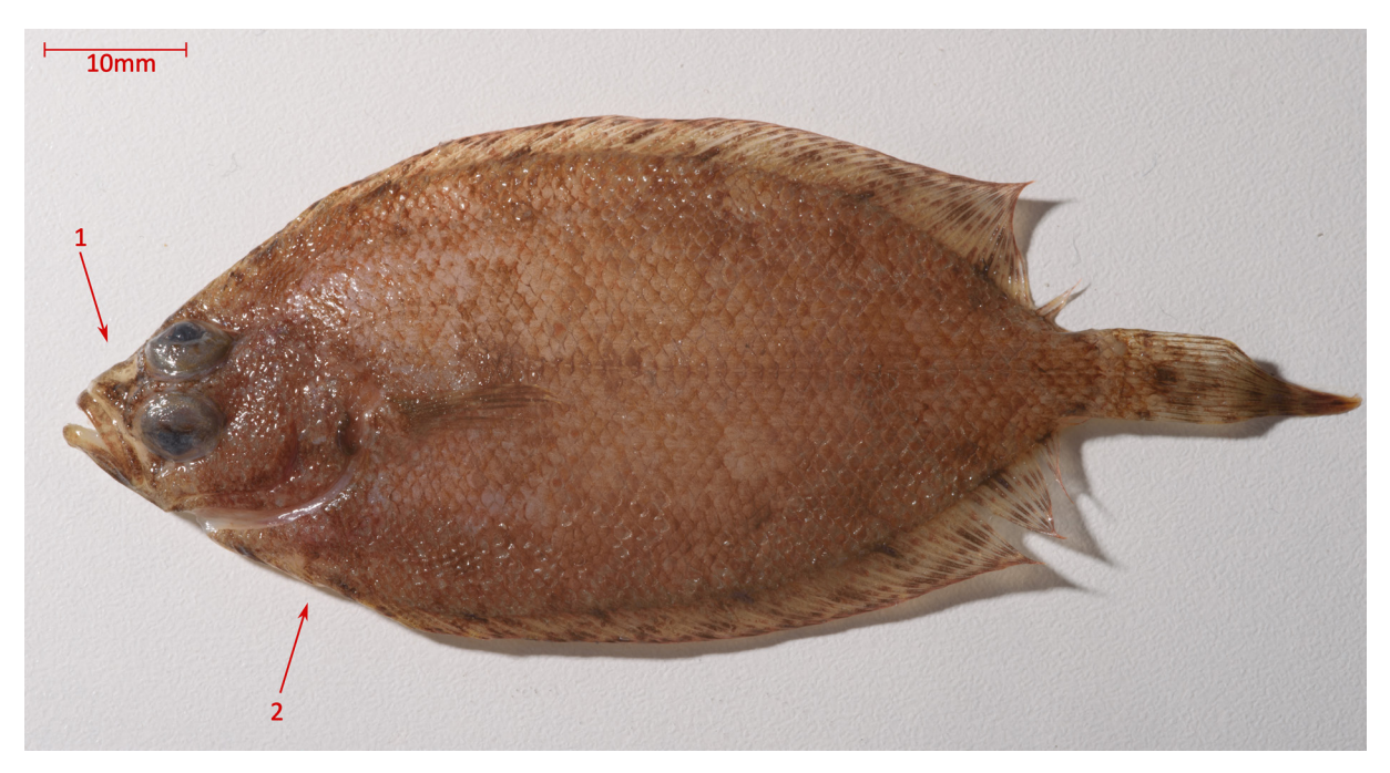
Figure 4 – Zeugopterus norvegicus caught off the UK coast, preserved by freezing (total length 91 mm), August 2022. Pointed head lacking a distinct notch (1), and separated pelvic and anal fins (2) are shown.

Ship time for ILVO fish trails on board of R.V. Belgica was provided by BELSPO through RBINS and funded by the European Maritime and Fisheries Fund (EFMZV). Special thanks to the crew of the