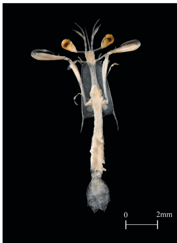
Fig. 1. – Picture of the 6 th stage megalopa larva of Rissoides desmaresti (specimen 1).

In Belgian waters, adults have so far never been recorded (12). However, Stomatopoda larvae were collected by G. Gilson during the European ICES (International Council of the Exploration of the Sea) campaigns between 1902 and 1913 (Gilson collection, largely preserved at the Royal Belgian Institute for Natural Sciences (RBINS)