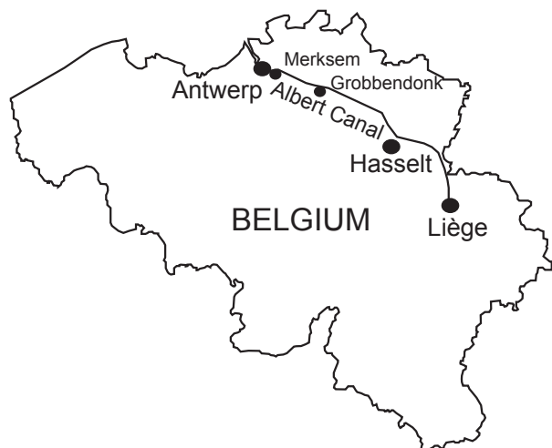
Fig. 2. – Map showing the Albert Canal in Belgium and sampling sites (Merksem and Grobbendonk).

and since, according to INBO (the Belgian Research Institute for Nature and Forests), round goby catches in fyke nets are very poor, most data come from anglers (VERREYCKEN, 2012, personal information); indeed at Grobbendonk in