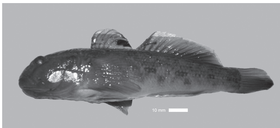
Fig. 1. – Male specimen of Neogobius melanostomus from the Albert Canal at Grobbendonk (TL = 137 mm), exhibiting the characteristic black spot on the first dorsal fin. Specimen not preserved.

The round goby is native to the Ponto-Caspian area, where it is a euryhaline benthic species of some economic importance (3). Neogobius melanostomus was transported with ballast water of cargo ships to the region of the Great Lakes in North America and to different countries in Central, East, North and West Europe (4, 5, 6). In the Netherlands the round goby was found for the first time in 2004 in the River Lek (7). It was reported for the first time in Belgium on April 8 th , 2010 from the River Scheldt near the Liefkenshoektunnel (1). The round goby probably reached the River Scheldt in the ballast water of cargo ships. The species is also known from different places in the Albert Canal, which is connected to the river Scheldt at Antwerp. Since the canal is far too deep for electric fishery