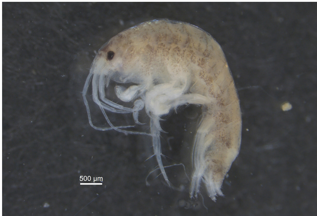
Figure 2 – A preserved specimen of Leptocheirus pilosus from the Hout Dock (Antwerp, Belgium).