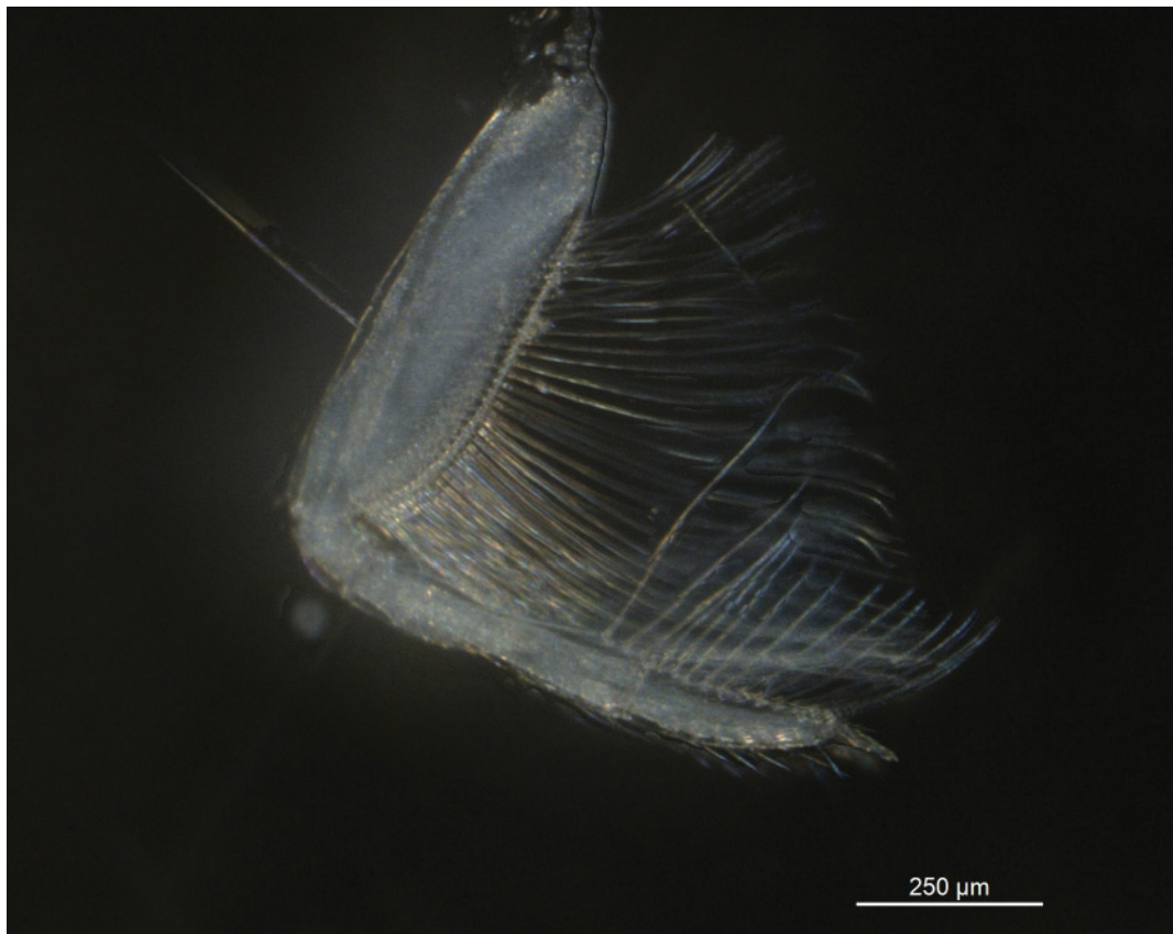
Figure 3 – A close-up of the long feathery setae on the second gnathopod of a preserved specimen of Leptocheirus pilosus from the Hout Dock (Antwerp, Belgium), which are an important diagnostic feature of the species [1,2].